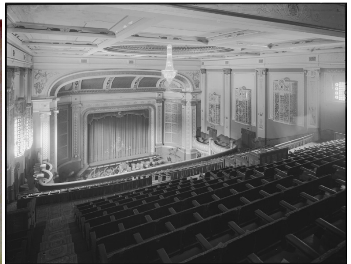
Capitol 1929 - 1967 38 years