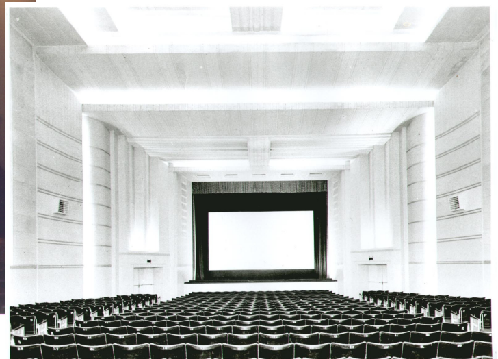
Plaza 1938 - 1984 47 years