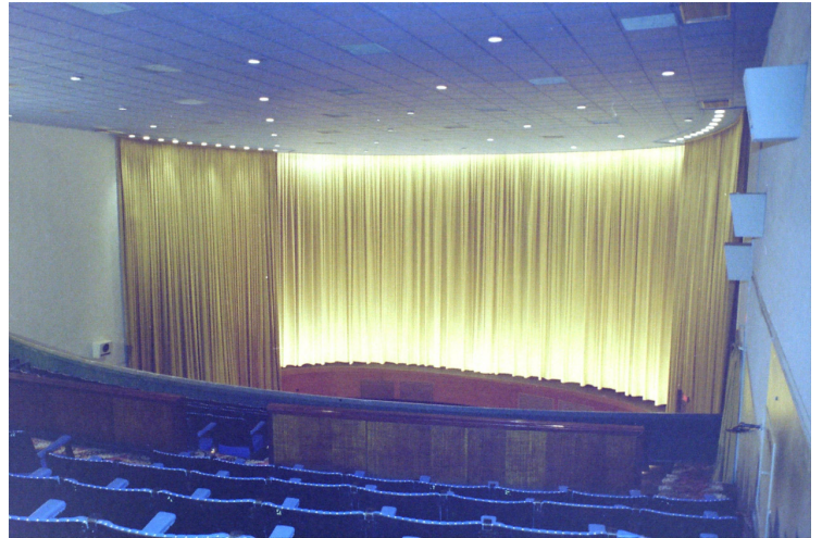
Theatre Royal 1897 - 1978 81 years