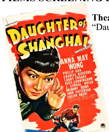
Theatre Royal "Daughter of Shanghai"