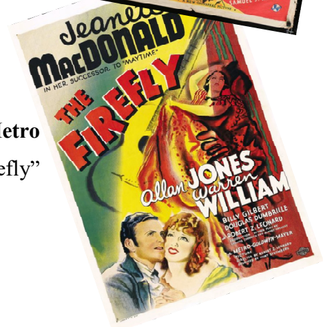
Metro "The Firefly"

Grand - Closed for four weeks for renovations