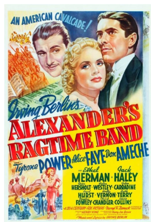
Hoyts Plaza "Alexander's Ragtime Band"