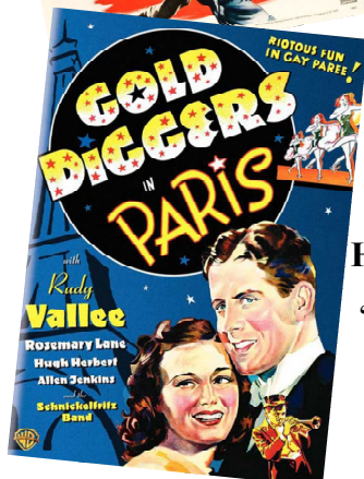
Hoyts Capitol "Gold Diggers of Paris"