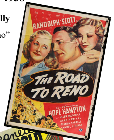
Piccadilly "Road To Reno"