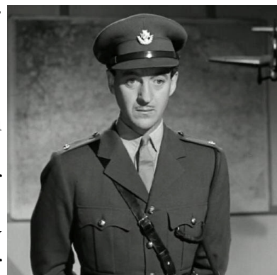
Above: David Niven