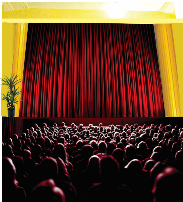
Lyric Theatre Maylands Recreation of the original cinema 1923